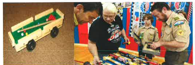
Pool table derby car

When you first audition for Broadway Bound it can make you nervous.... but this is our first time doing it and it is really fun. Lots of Westie students are doing it this year. You have to be from third to fifth grades to perform with Broadway Bound. We get 17 weeks to practice for the show. That means 17 practices in 17 weeks. Maybe next year you can join Broadway Bound for fantastic fun!