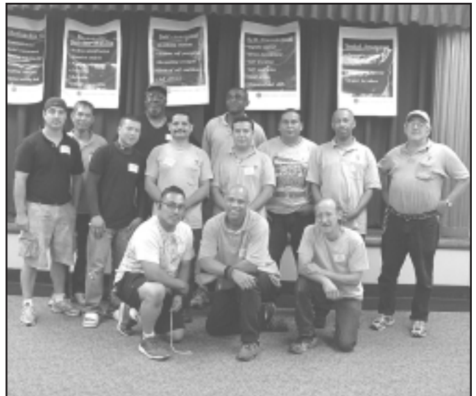
Office staff (below left) and janitorial staff (above) also participated in SEL training sessions over the summer.