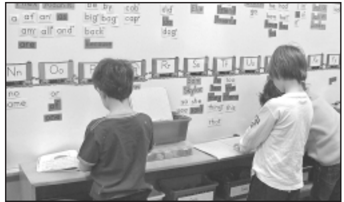
A Word Wall helps South School students build their vocabulary.