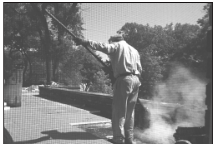
Workers up on the rooftop of South School

Additionally, the mechanical components of the 30-year old Central School elevator were replaced and upgrades completed. Funding for these maintenance projects was made possible through the refinancing of bonds completed in the 2009-2010 school year.