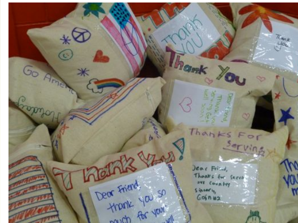
Left: Veterans from Hines VA receiving TKC pillows- just in time for the holidays! Above: TKC pillows hand decorated by students at Central School