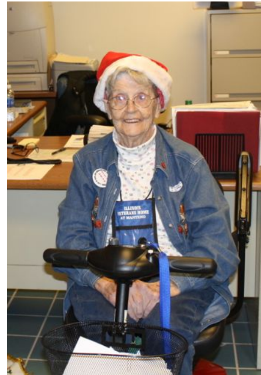
Above and Right: Residents from a Veterans Home in Manteno receiving their decorated TKC tissue and trinket boxes.