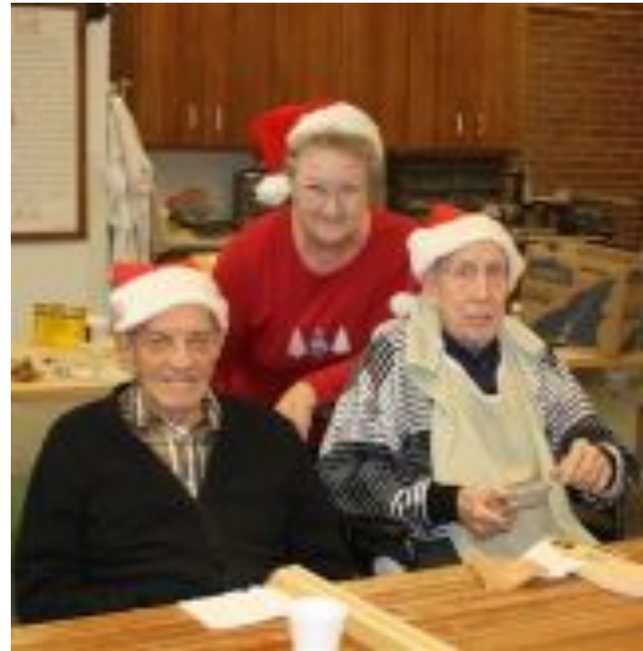
Above: Residents from a Veterans Home in Manteno, IL

-Vice President of External Relations, Volunteers of America of Illinois