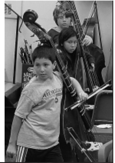
The halls were alive with the sound of music in 2008-09.