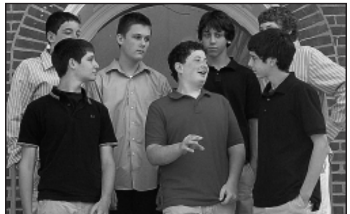
The rites of Central School graduation: These young men are preparing to pose for the traditional Class Picture.