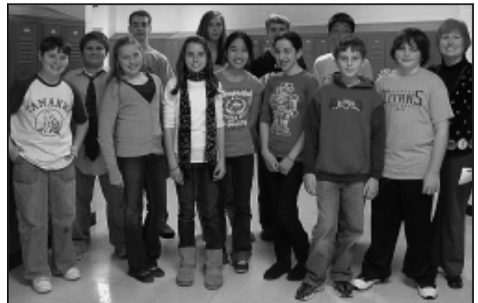
Twelve 7th and 8th graders were winners in the Health Essay Contest. Their topic: "These Are the Healthy Choices I Am Making Now and that I Plan to Continue as I Go on to High School."