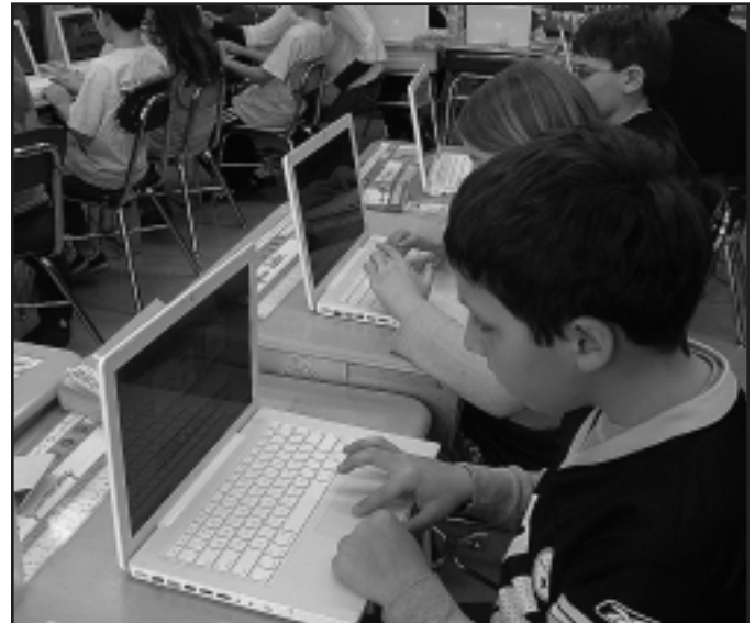
New laptop carts deliver portable, productive, and popular technology to individual students in classrooms at West and Central Schools. See story, page 3.

Cathlene A. Crawford Superintendent, Glencoe School District 35