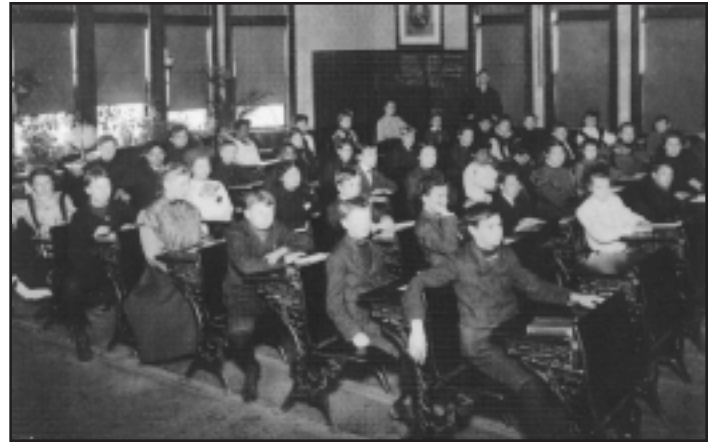
Central School in the early 1900s: Archibald MacLeish is identified as the second student from the left in the second row (with his hand at his face).