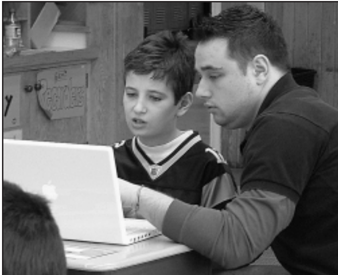
Students at West and Central schools work in their classrooms with laptop computers. The PTO purchased mobile laptop carts for the schools.

The topic of Internet Safety is addressed in grades K through 8 with a variety of developmentally appropriate activities and materials. At South and West Schools, formal instruction is incorporated into the scheduled Library Learning Center time. At Central School, students receive instruction in a required activity class, called School Skills for Success. Additionally, Internet Safety is taught and appropriate behaviors reinforced through the WE CARE and Ally programs.